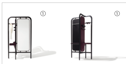
1 Amiral 53715 leather 9118 fin.93